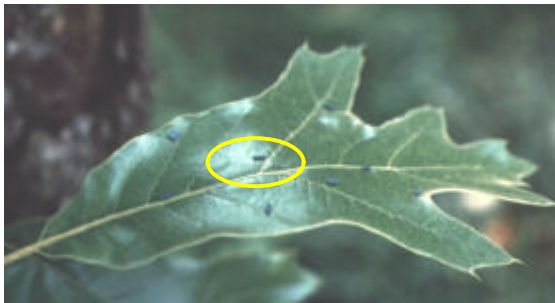
Gypsy moth mating disruptant on foliage