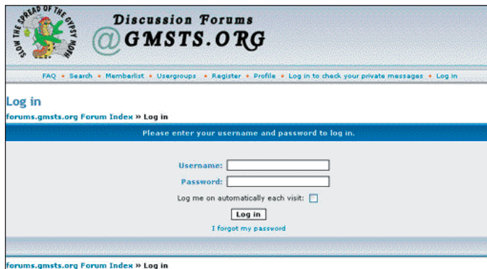
Figure 1. Discussion Forum login screen.

The new STS Discussion Forum is an integrated way to communicate ideas, requests, and data corrections with the groups that manage them. This service is located at http://forums.gmsts.org and can also be found on the main menu of the STS Operations Portal ( http://operations.gmsts.org ).